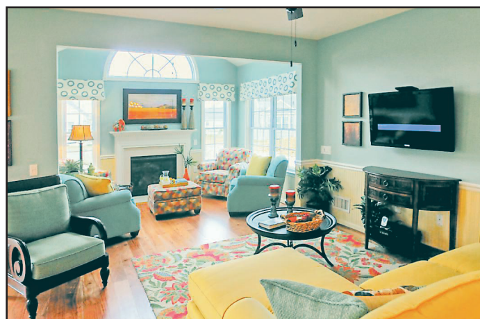
This is the inside of the Washington model home at Traditions of America at Mount Joy.